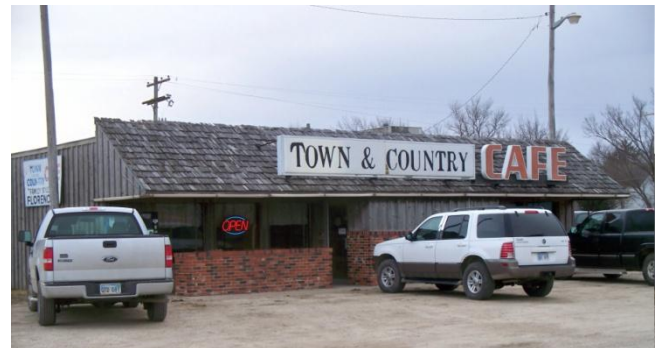
Breakfast customers at the Town & Country café.