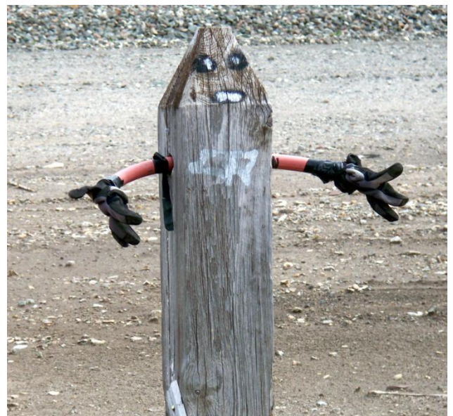
Have you met one of Florence's most unique citizens? Rumor has it he was abandoned and made his home here because the folks are all so nice.